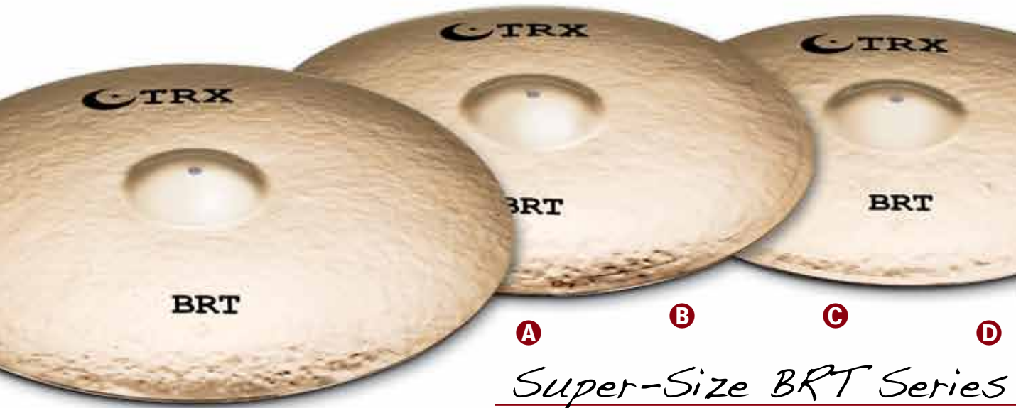
Super-Size BRT Series